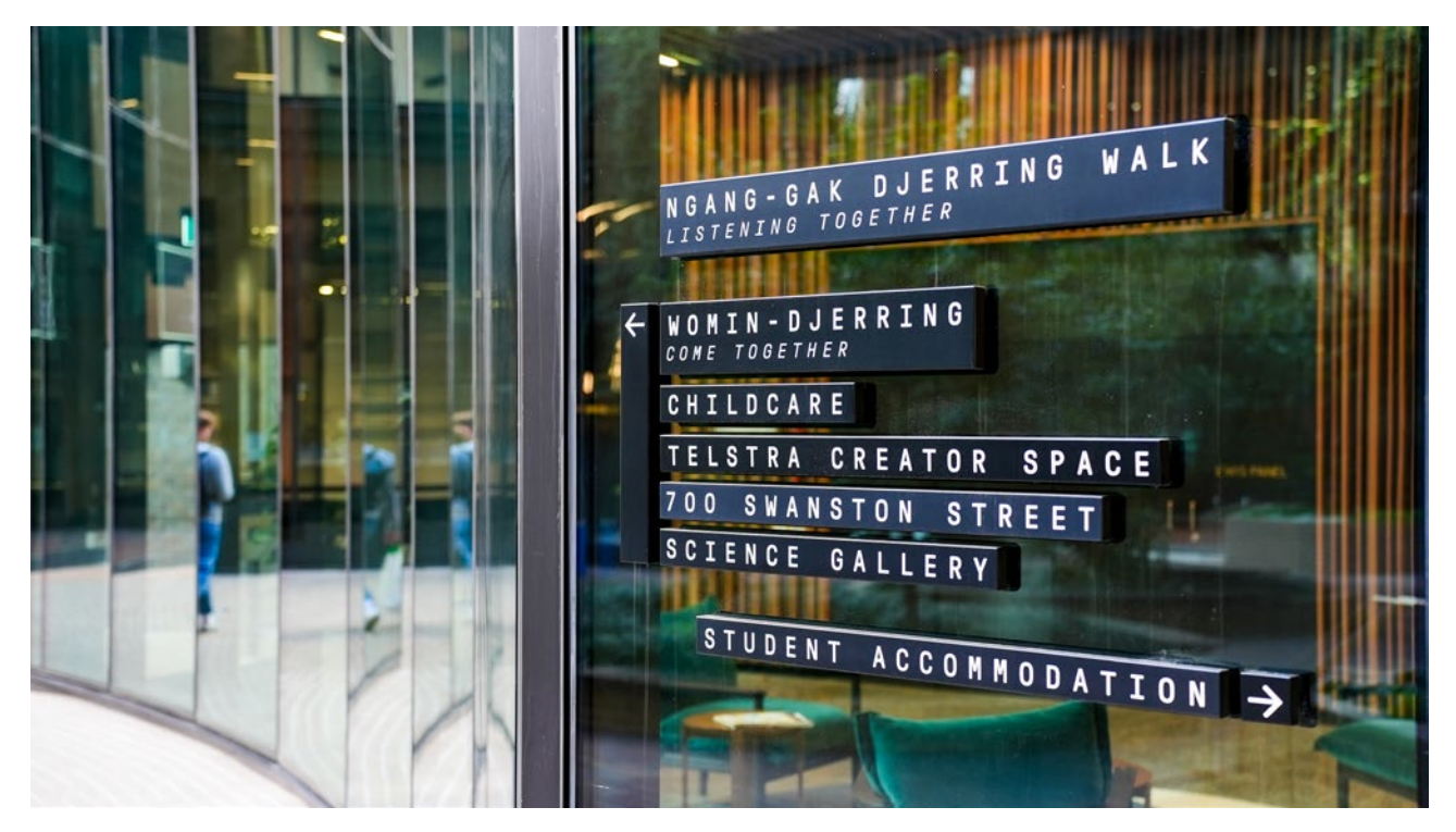
Womin-djerring (come together) is an open-air oculus that sits in the centre of Melbourne Connect, a purpose-built innovation precinct. Surrounded by four laneways – Tongerambi kalk Way (birthing tree), Ngang-gak djerring Walk (listening together), Yagila-djerring Walk (learning / searching together) and Toom-djerring Walk (speaking together) – this space connects the public to the precinct