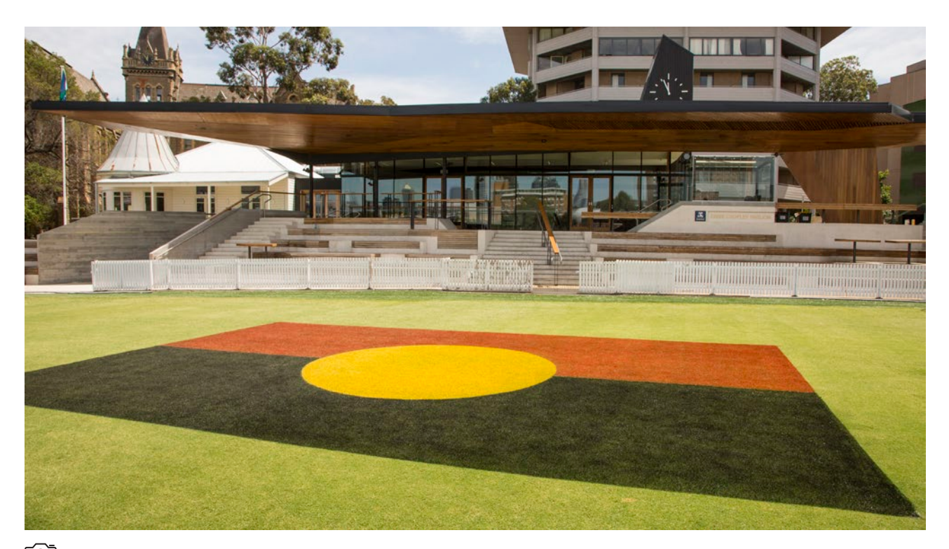
The Aboriginal flag displayed proudly on the University oval opposite the Ernie Cropley Pavilion