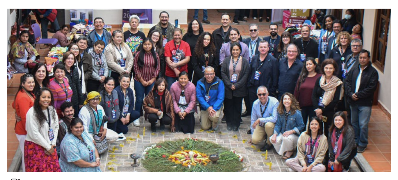
\begin{bmatrix} 0 \end{bmatrix}