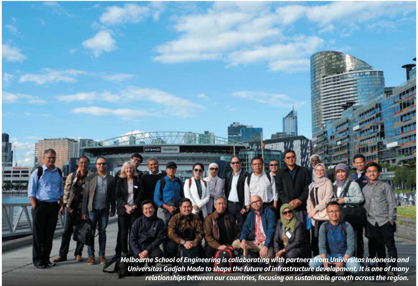
Melbourne School of Engineering is collaborating with partners from Universitas Indonesia and Universitas Gadjah Mada to shape the future of infrastructure development. It is one of many relationships between our countries, focusing on sustainable growth across the region.

Indonesia is working on challenging reforms to health, sustainable development and governance. It is also increasingly playing a leadership role on an international stage – notably through its participation in the UN Sustainable Development Goal process, and through leadership in the ASEAN region.